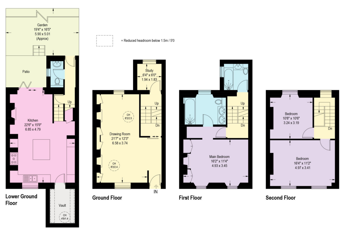
Illustration for identification purposes only, measurements are approximate, not to scale. (ID1116210)

This plan is for guidance only and must not be relied upon as a statement of fact. Attention is drawn to the important notice on the last page of the text of the Particulars.