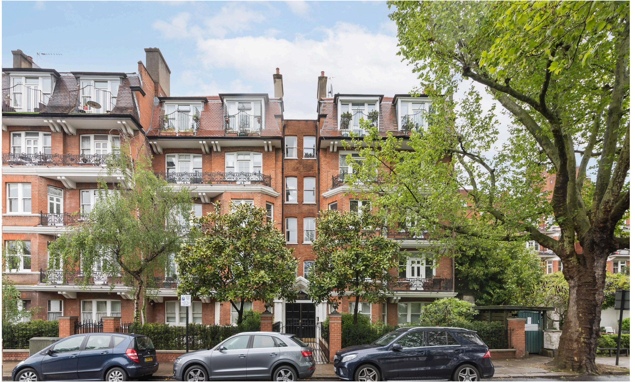
Ashburnham mansions, Chelsea SW10