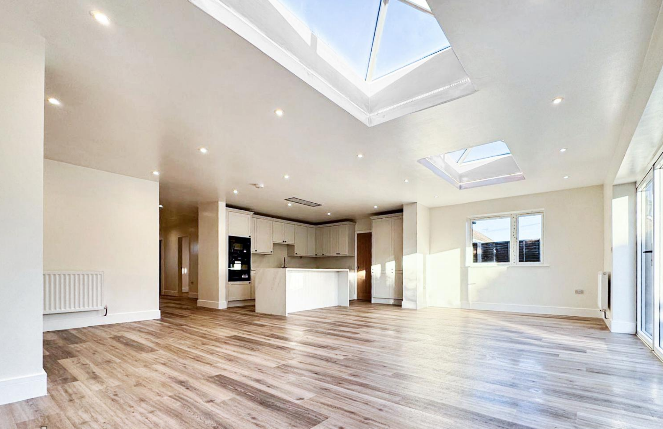
Wyndham Crescent, Clacton-on-Sea, CO15 6LH