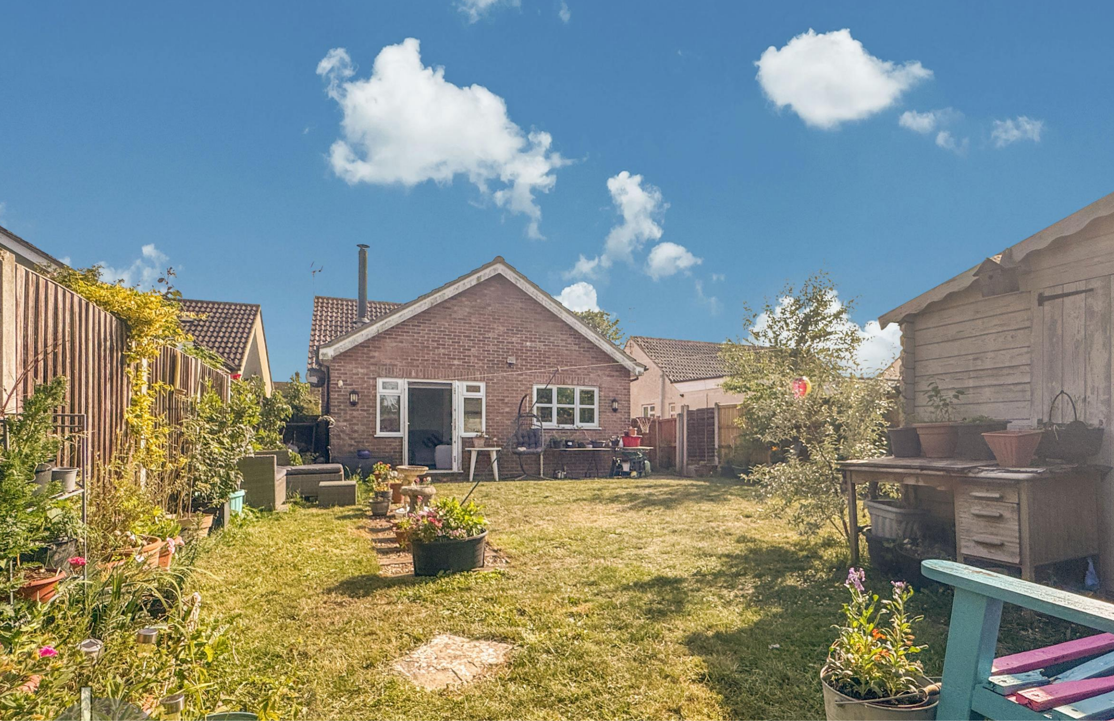
Brybrook, Chapel Lane, Elmstead, Colchester, CO7 7AG