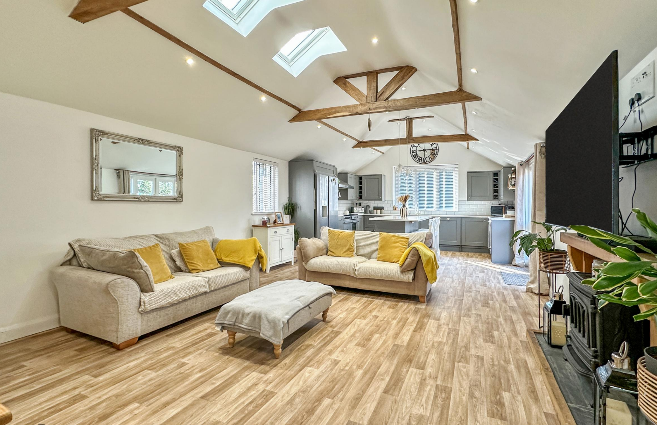
The Causeway, Great Horkesley, Colchester, CO6 4EJ