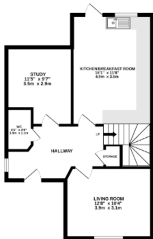
GROUND FLOOR 576 sq. ft. (53.5 sq.m.) approx.