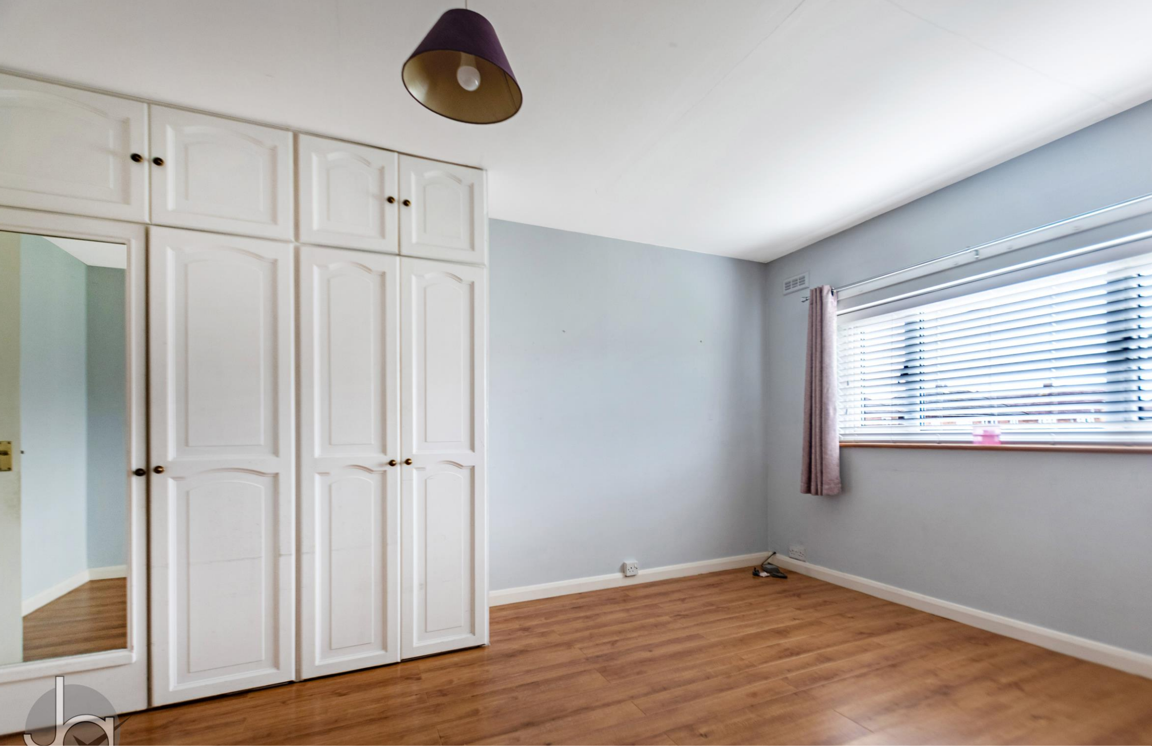
Cape Close, Colchester, CO3 4LX