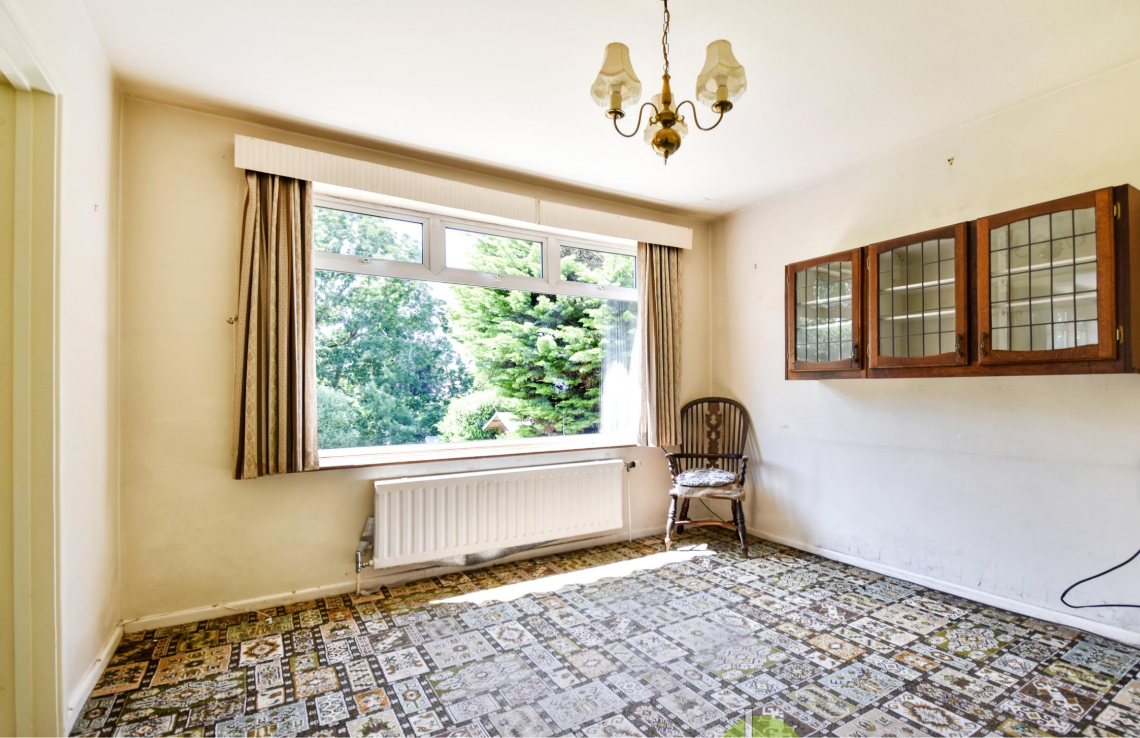
Church Lane, Colchester, CO3 4DX