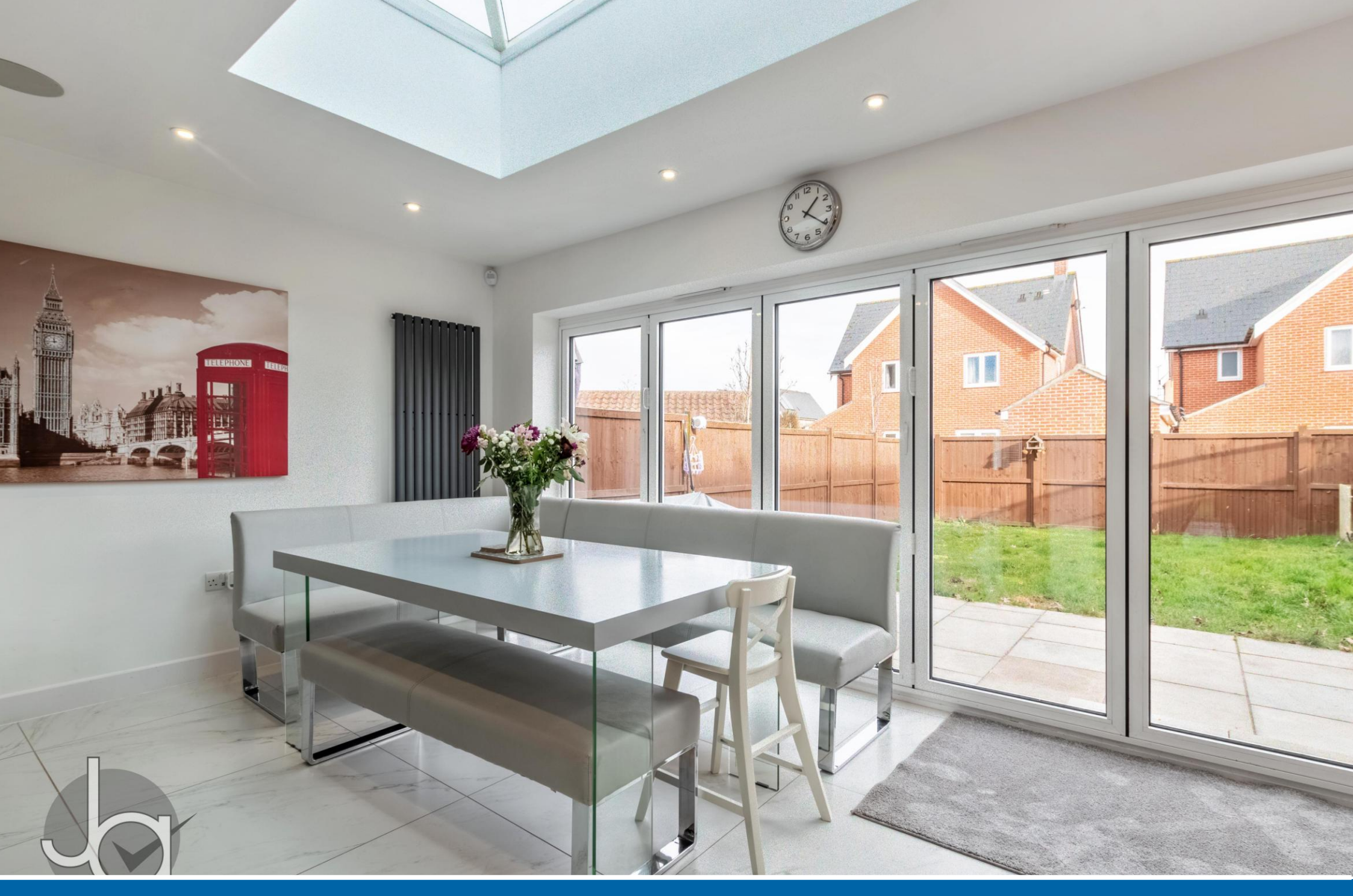
Spartan Close, Great Horkesley, Colchester, CO6 4FL