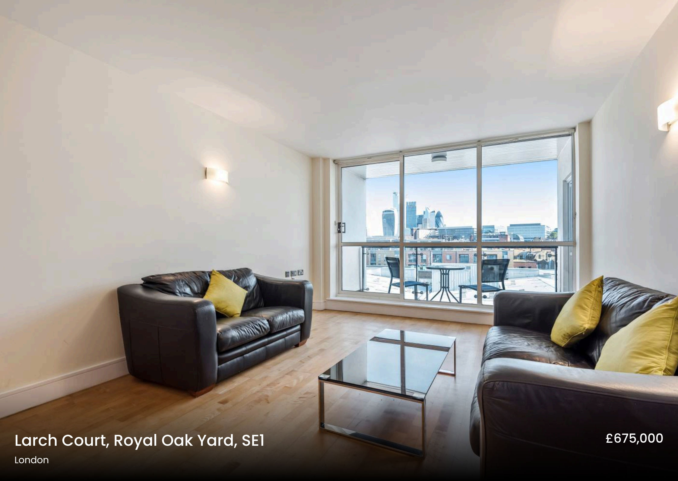
Larch Court, Royal Oak Yard, SE1 London