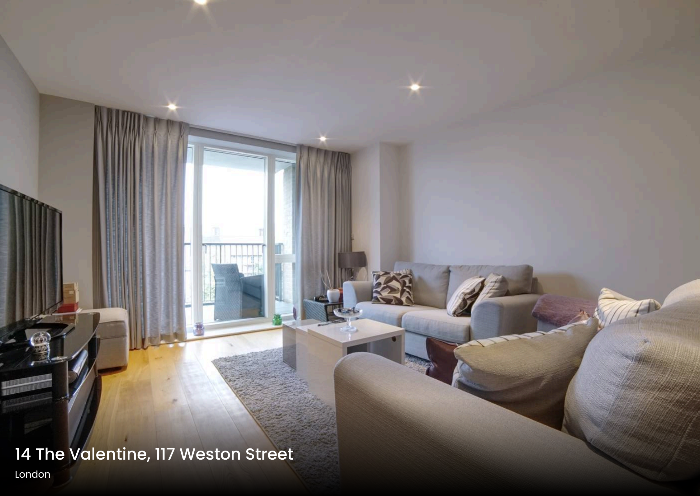
14 The Valentine, 117 Weston Street London