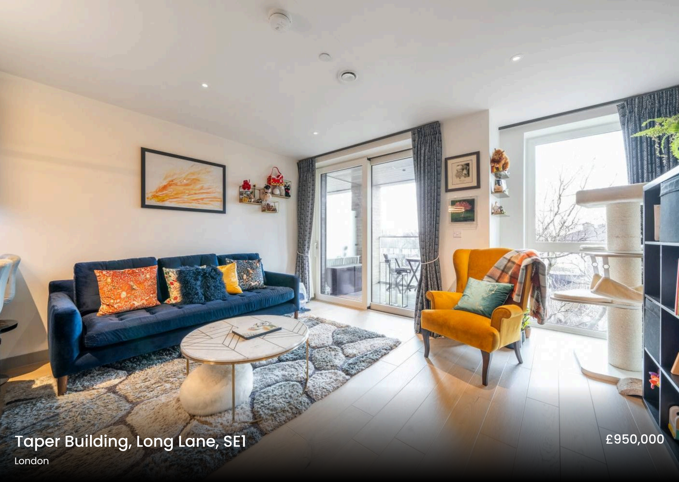
Taper Building, Long Lane, SE1 London