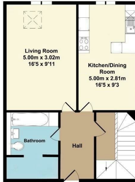
Ground Floor Approx. Floor Area 47.95 Sq.M. (516 Sq.Ft.)