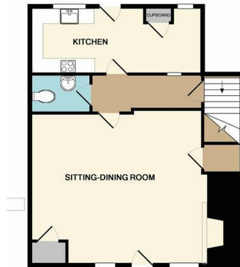
GROUND FLOOR APPROX. FLOOR AREA 579 SQ.FT. (53.7 SQ.M.)