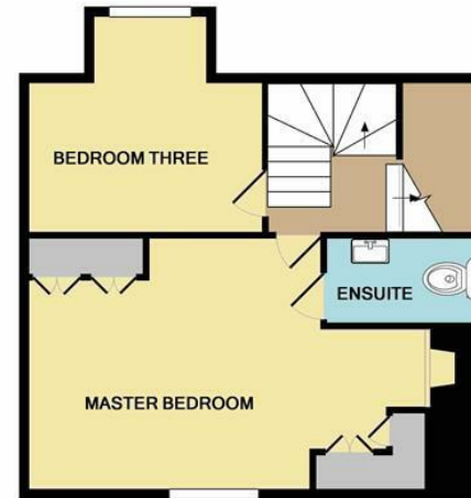
1ST FLOOR APPROX. FLOOR AREA 457 SQ.FT. (42.4 SQ.M.)