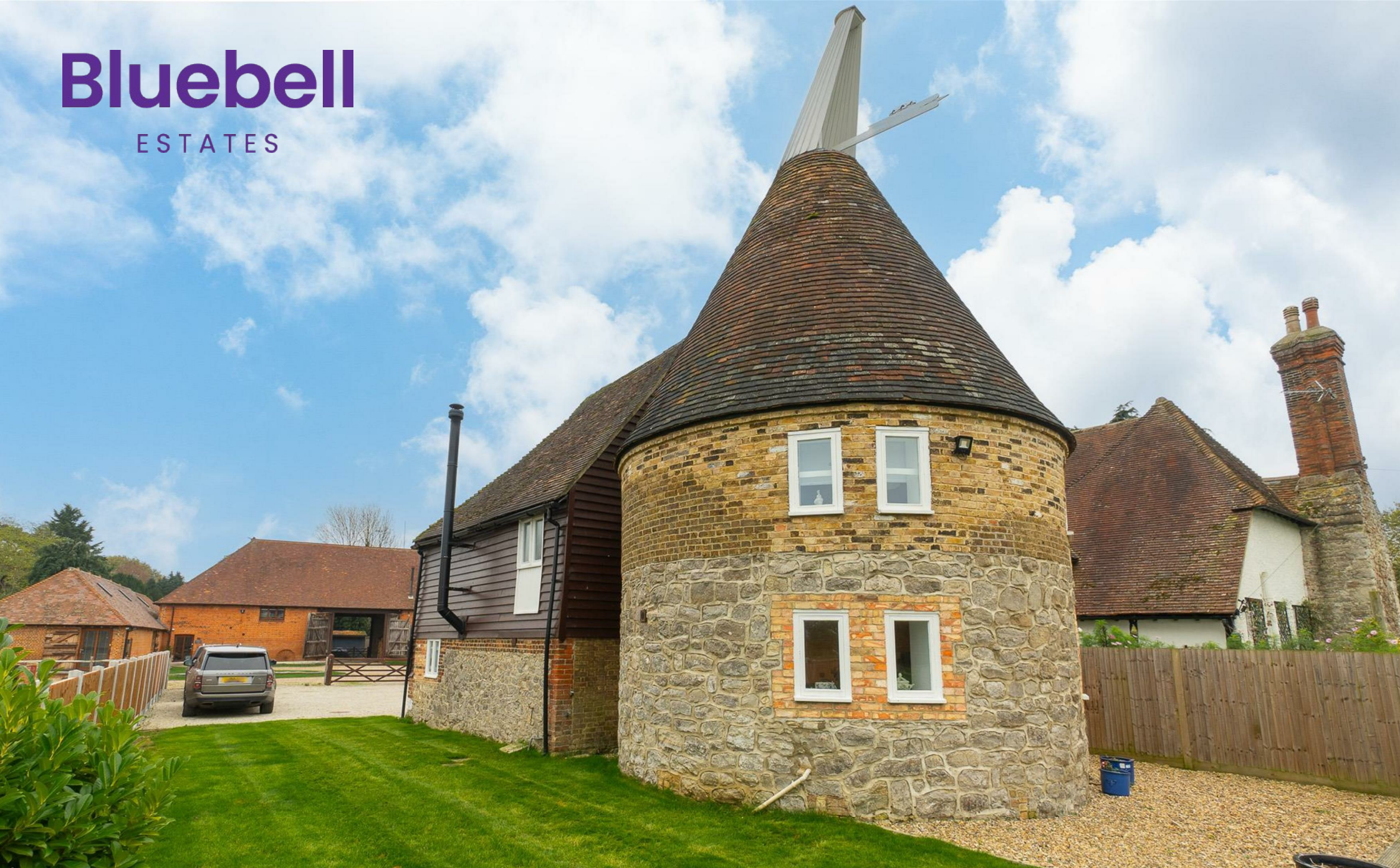
The Oast, 96 High Street, Aylesford, ME20 7AZ £800,000