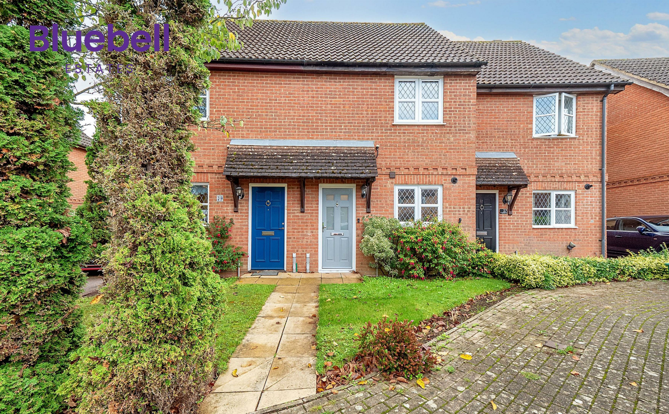
28, Garden Way, Kings Hill, West Malling, ME19 4FH £350,000