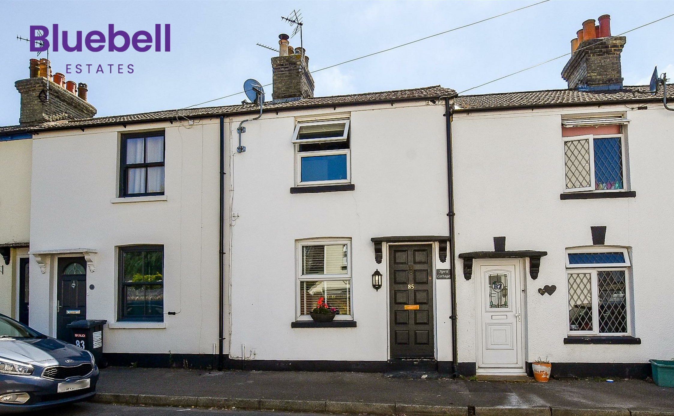
April Cottage, 85, Cork Street, Eccles, ME20 7HQ £269,500