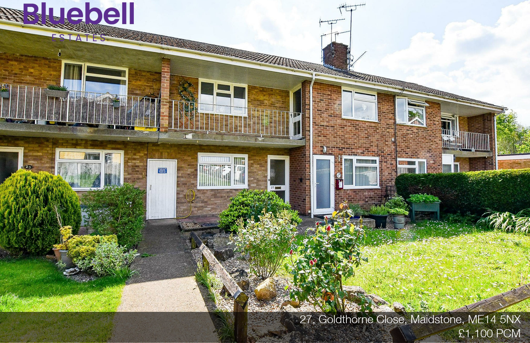
27, Goldthorne Close, Maidstone, ME14 5NX £1,100 PCM