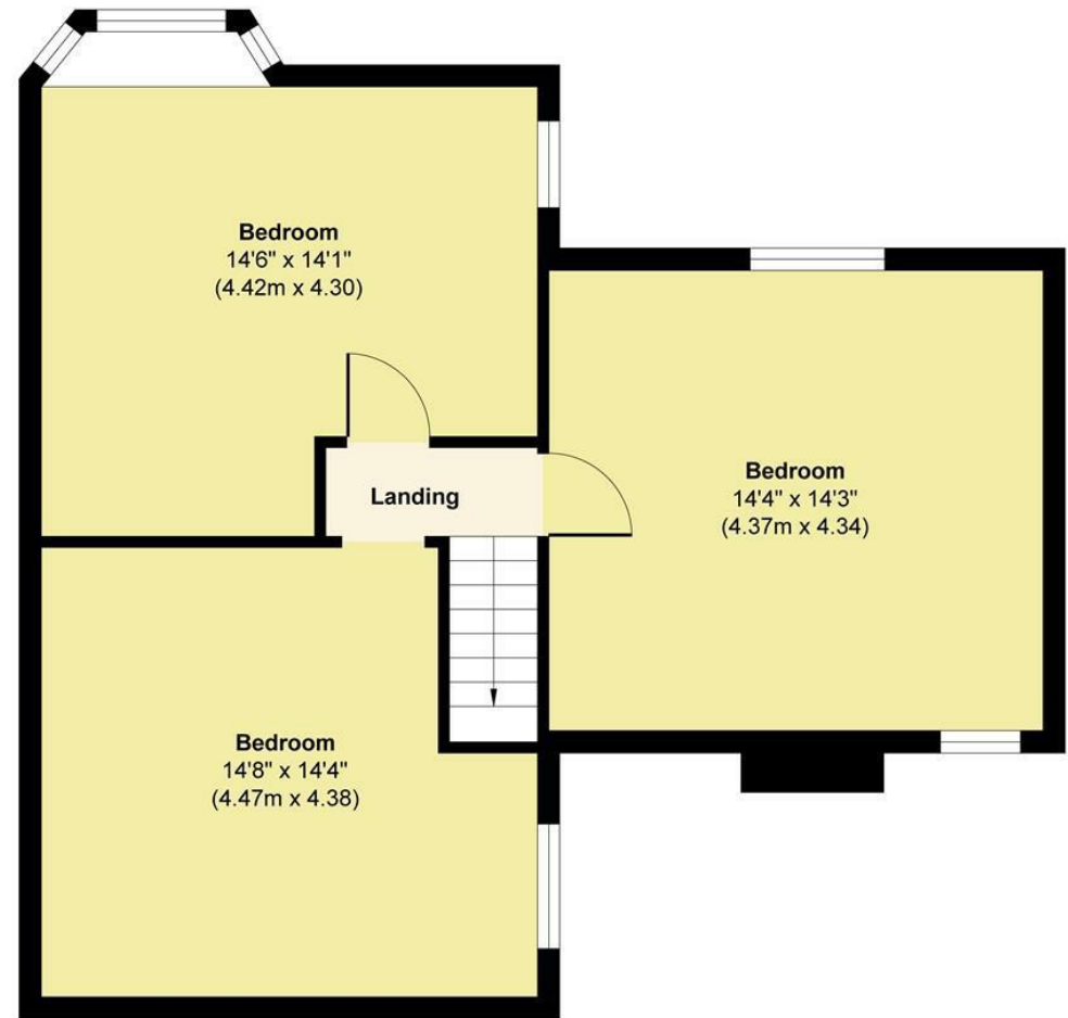
First Floor Approximate Floor Area 613 sq. ft (57.04 sq. m)

Approx. Gross Internal Floor Area 1256 sq. ft / 116.78 sq. m