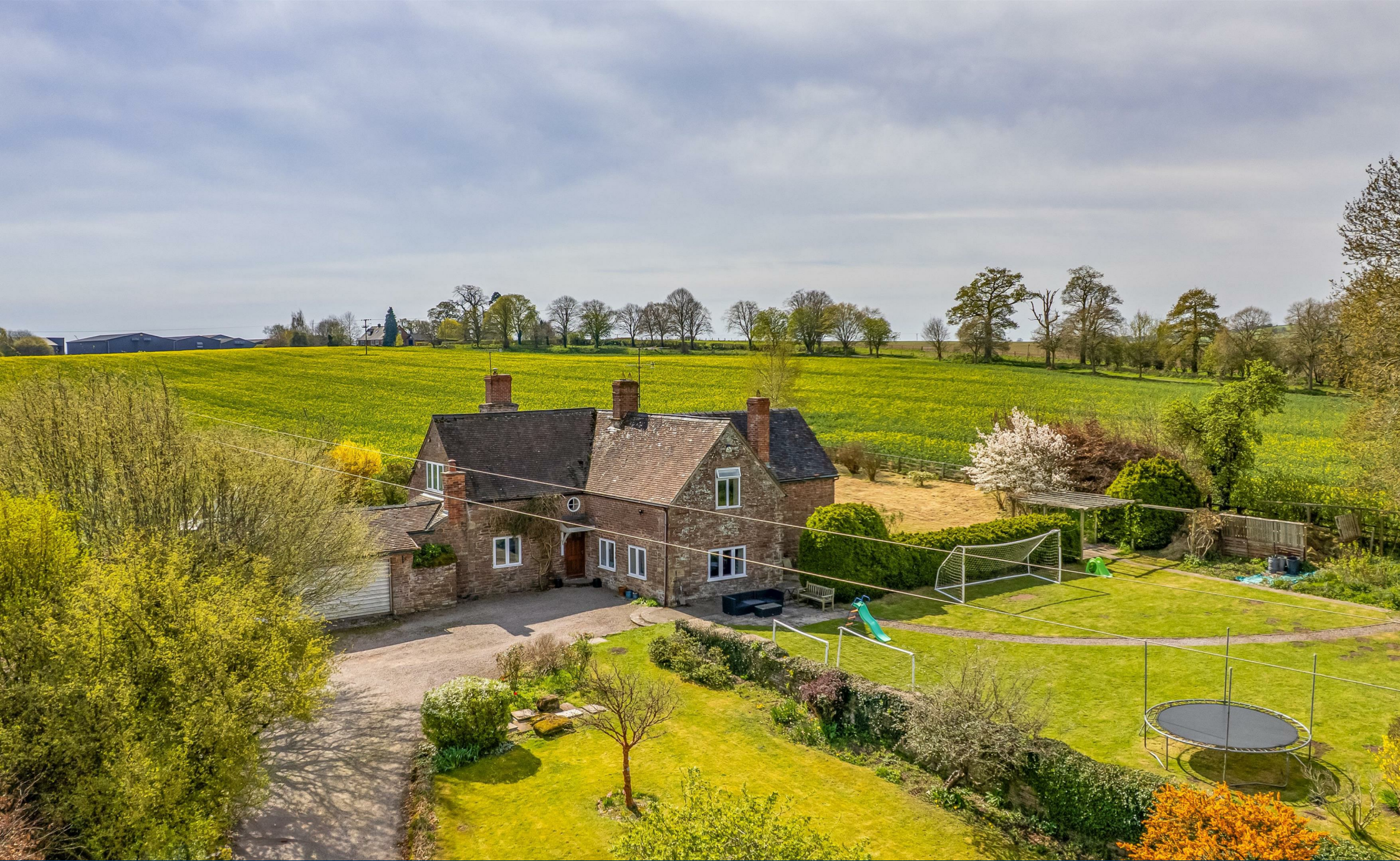
Old Manor House Llanwarne, Hereford, HR2 8JE