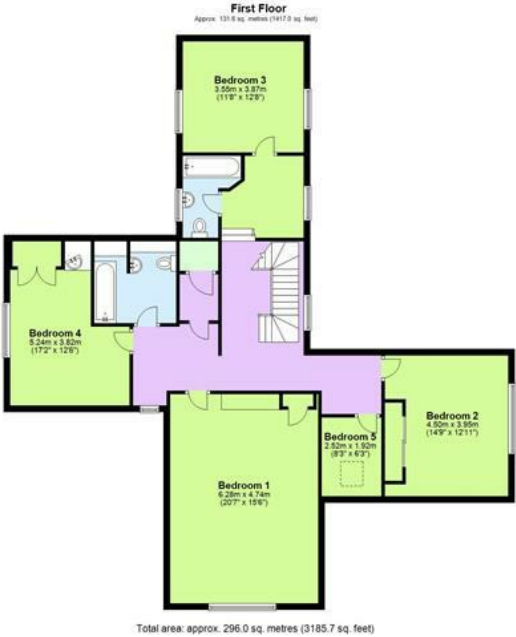
Total area: approx. 296.0 sq. metres (3185.7 sq. feet)