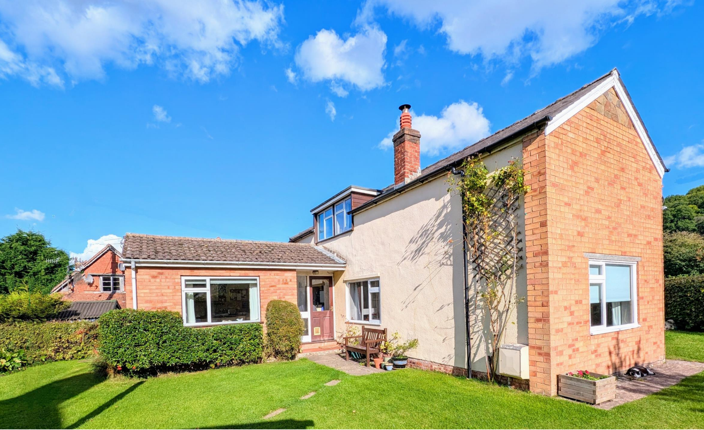
Rock Cottage, Priors Frome, Hereford HR1 4EG