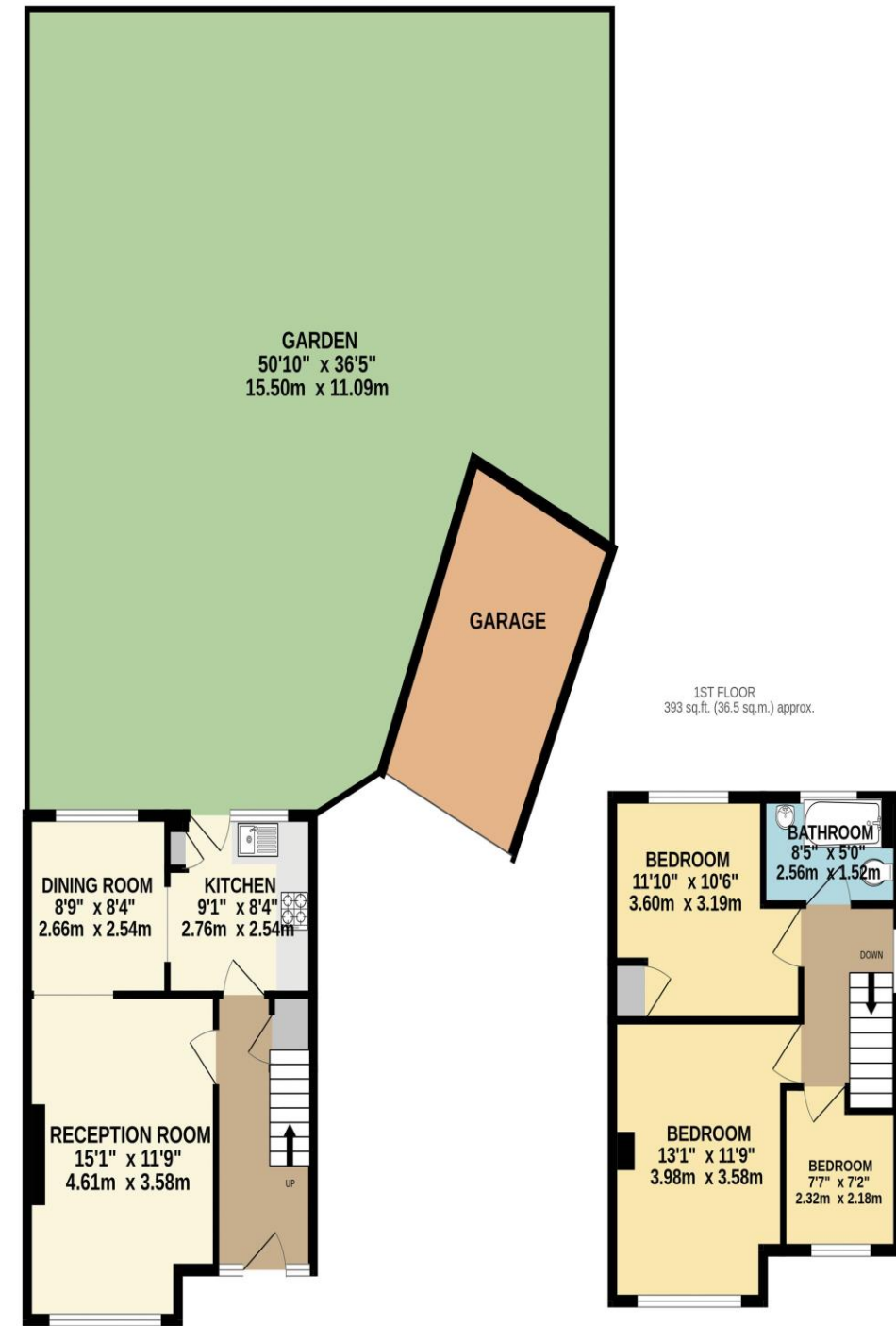
TOTAL FLOOR AREA : 929 sq.ft. (86.3 sq.m.) approx.

Whilst every attempt has been made to ensure the accuracy of the floorplan contained here, measurements of doors, windows, rooms and any other items are approximate and no responsibility is taken for any error, omission or mis-statement. This plan is for illustrative purposes only and should be used as such by any prospective purchaser. The services, systems and appliances shown have not been tested and no guarantee as to their operability or efficiency can be given. Made with Metropix ©2024