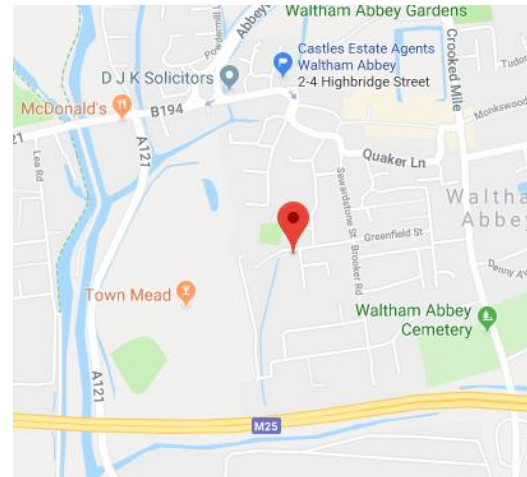
A Bit about Waltham Abbey

Borough : Epping Forest District Council County : Essex