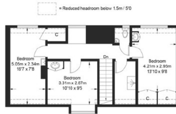
First Floor 56.5 sq m / 608 sq ft

Approximate Gross Internal Area = 179.7 sq m / 1934 sq ft