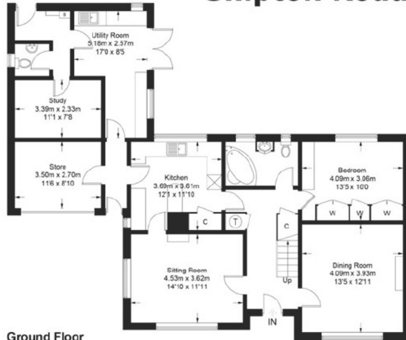
Ground Floor 123.2 sq m / 1326 sq ft