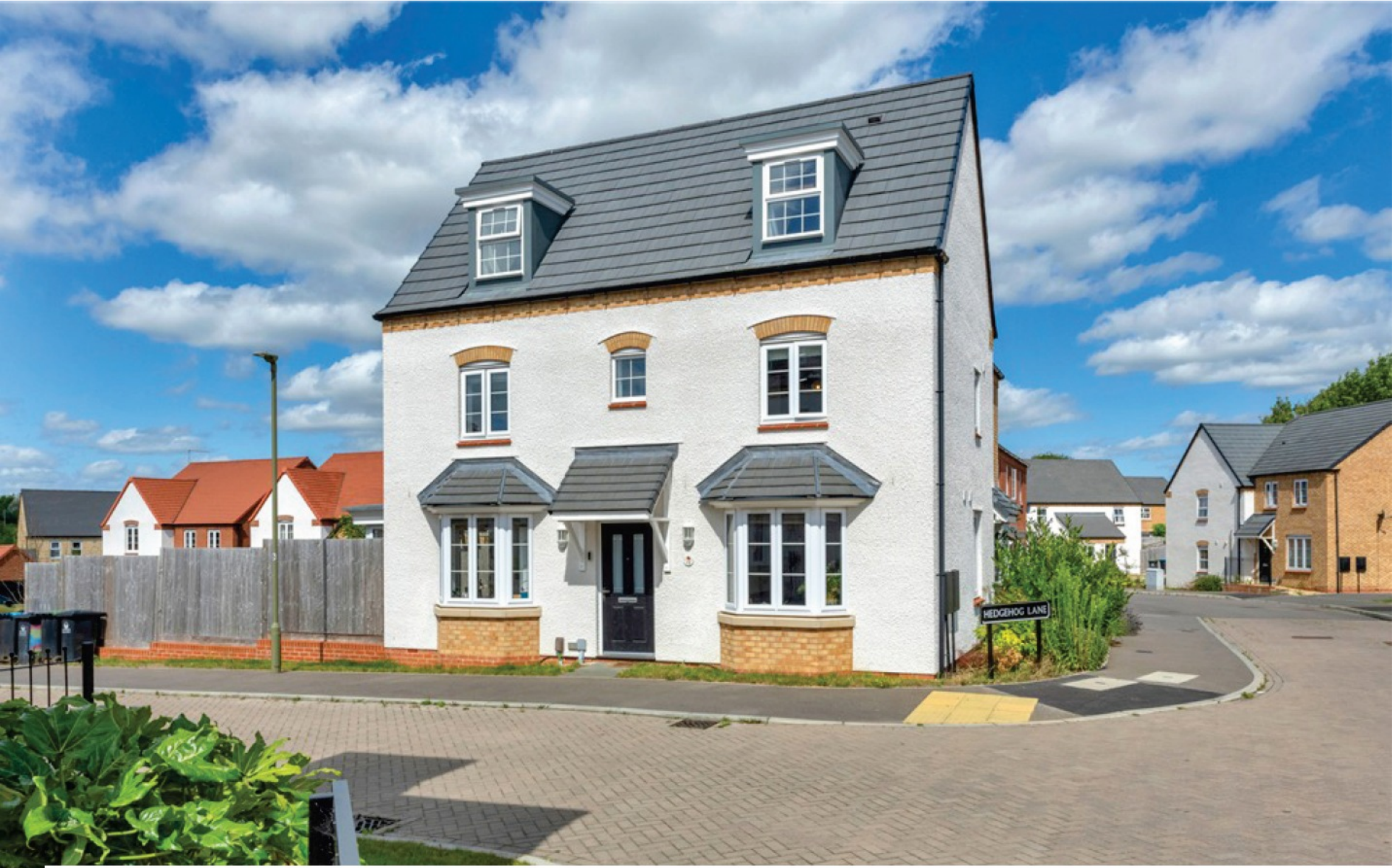
Hedgehog Lane, Witney