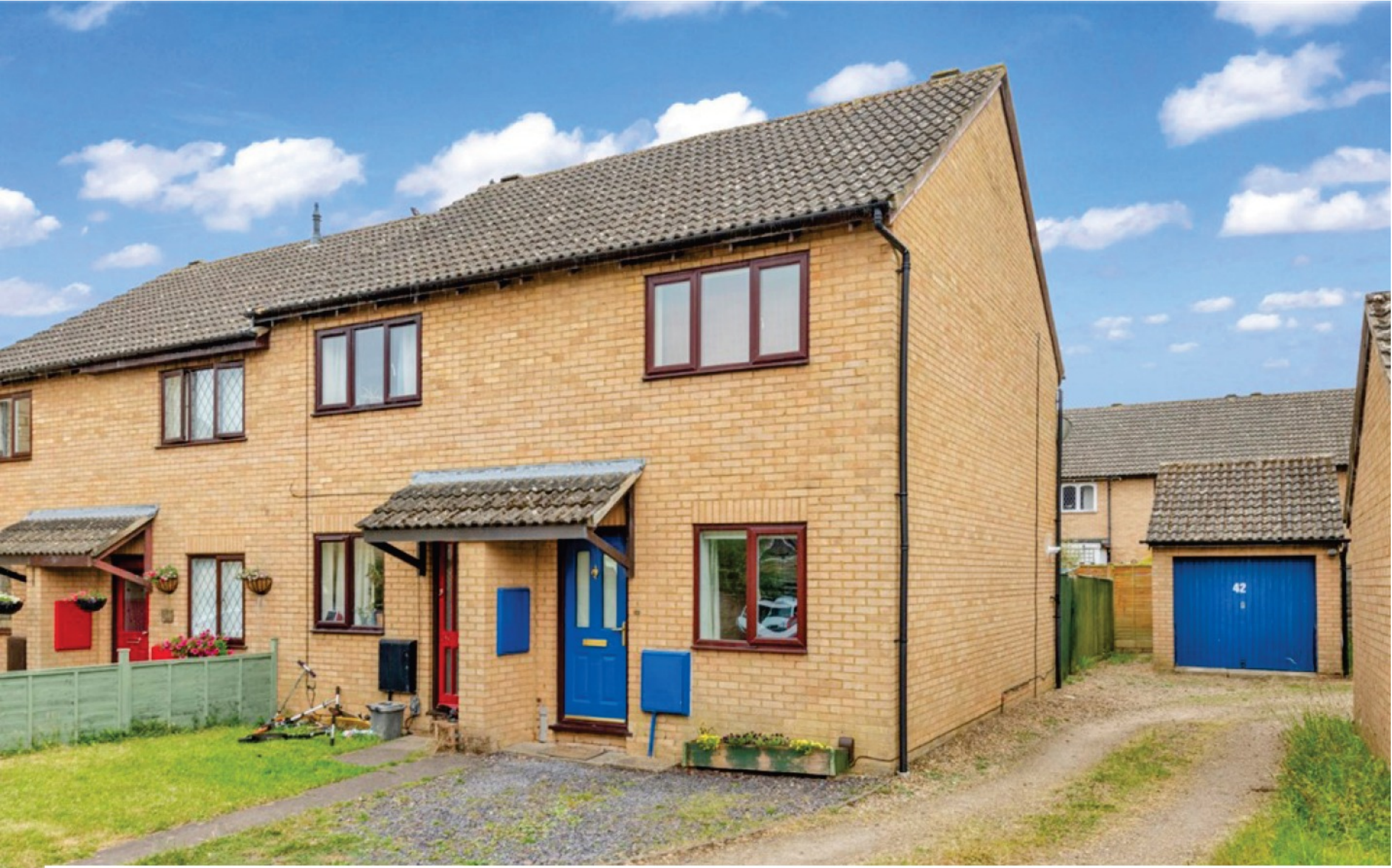
Dovehouse Close, Eynsham