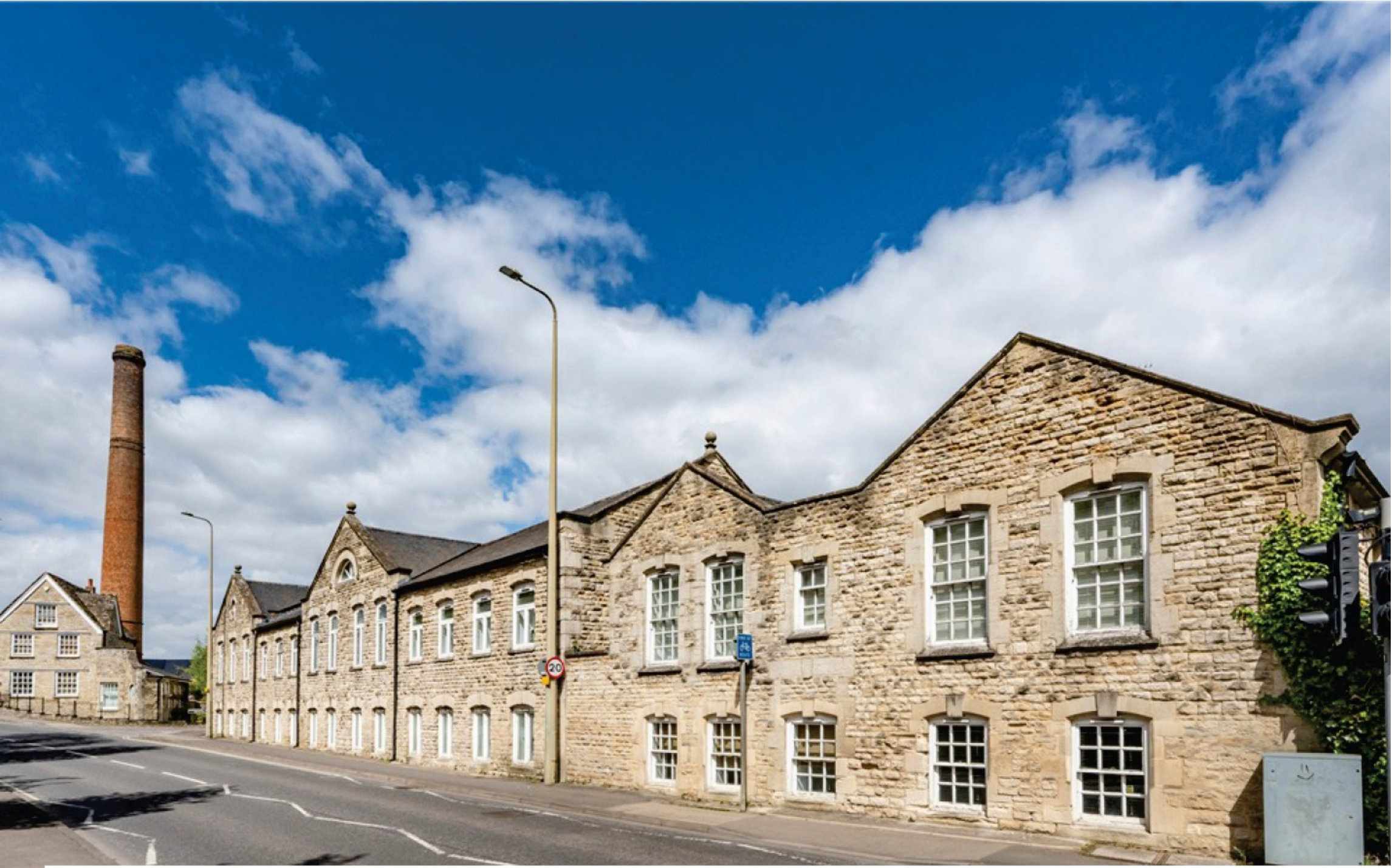
Woodford Mill, Witney