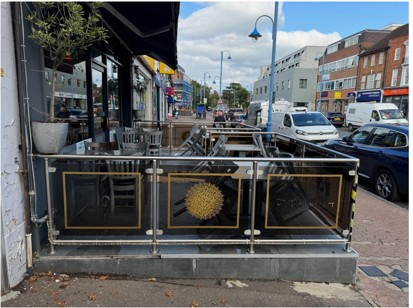
Potential for an outside seating area similar to another restaurant within the same parade. As shown in the photographs