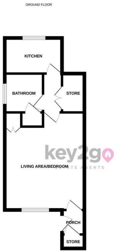
BLOSSOM CRESCENT, GLEADLESS, SHEFFIELD, S12 3GN Whilst every attempt has been made to ensure the accuracy of the floorplan contained here, measurements of doors, windows, rooms and any other items are approximate and no responsibility is taken for any error, omission or misstatement. This plan is for illustrative purposes only and should be used as such by any prospective purchaser. The services, systems and appliances shown have not been tested and no guarantee as to their operability or efficiency can be given. Made with Metropix C5024.