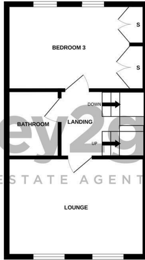
1ST FLOOR 389 sq.ft. (36.1 sq.m.) approx.