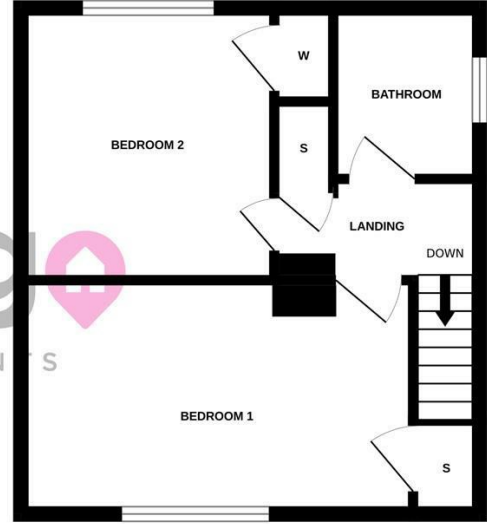
1ST FLOOR 332 sq.ft. (30.8 sq.m.) approx.