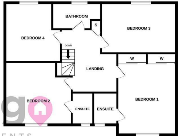
1ST FLOOR 908 sq.ft. (84.4 sq.m.) approx.