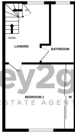
1ST FLOOR 343 sq.ft. (31.9 sq.m.) approx.