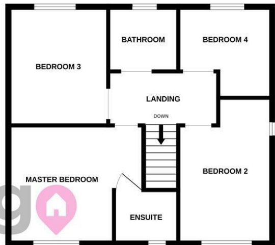
1ST FLOOR 588 sq.ft. (54.7 sq.m.) approx.