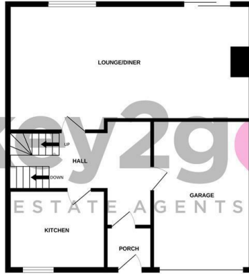
GROUND FLOOR 736 sq.ft. (68.3 sq.m.) approx.