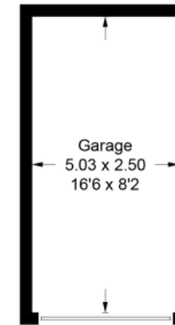
(Not Shown In Actual Location / Orientation)

Illustration for identification purposes only, measurements are approximate, not to scale. (ID670982)