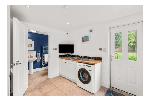
4 Bed | 3 Bath | 223m2