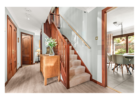
5 Beds | 3 Baths | 162m2