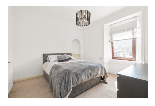
2 Beds | 1 Bath | 67m2