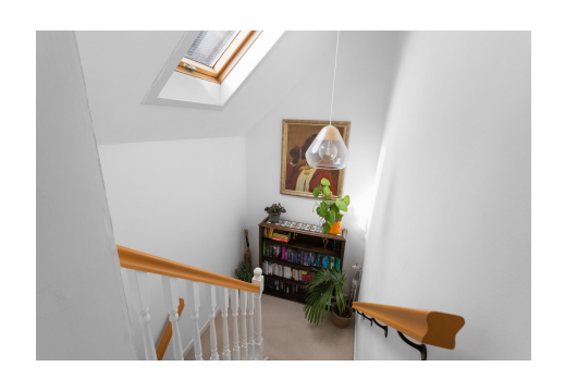
3 Beds | 1 Bath | 119m2