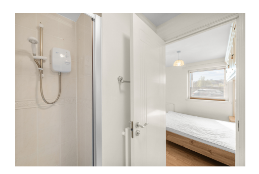
3 Beds | 2 Baths | 69m2