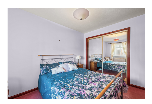
2 Beds | 1 Bath | 66m2