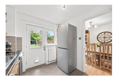
3 Bed | 2 Bath | 80m2