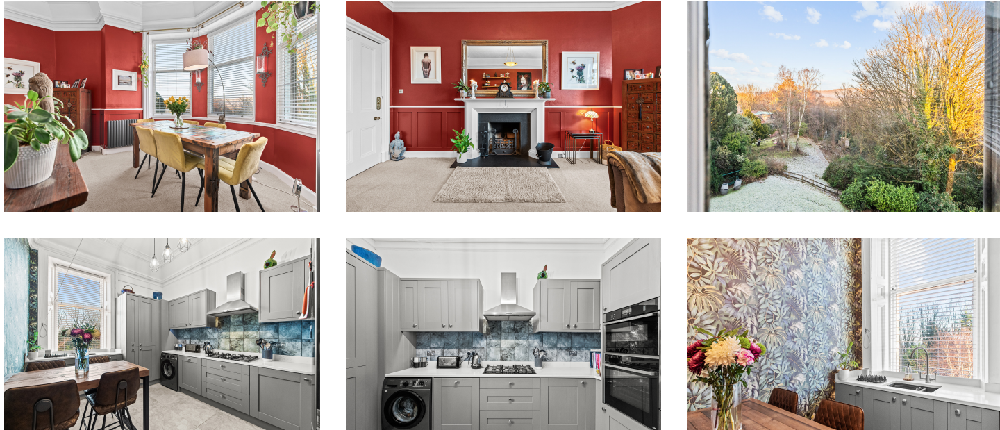
3 Beds | 2 Baths | 169m2