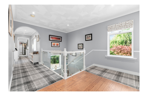
5 Beds | 3 Baths | 207m2