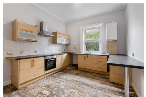
2 Beds | 1 Bath | 55m2