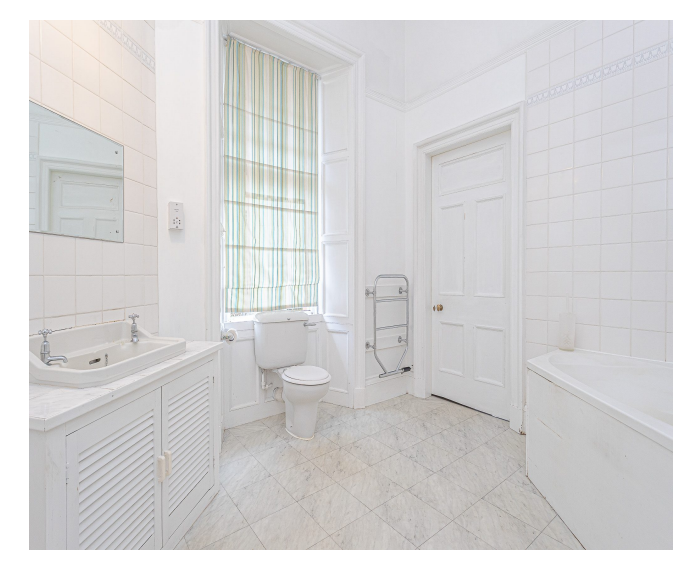
6 Beds | 3 Baths | 511m2