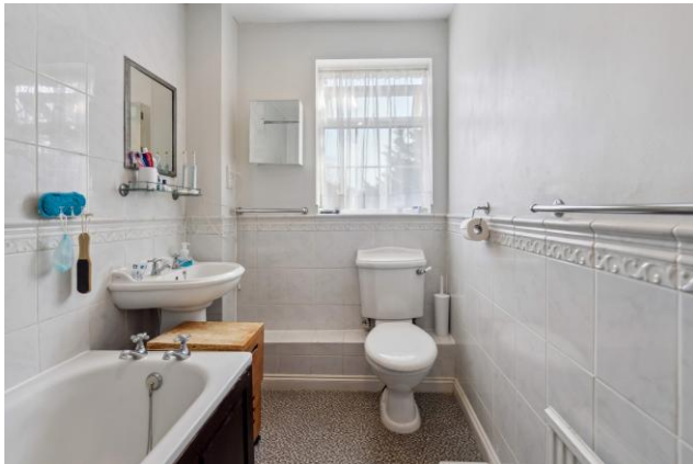
BATHROOM double glazed Georgian grill window, low w.c., pedestal wash basin, panel bath with Aqualisa shower unit, part tiled walls, radiator.