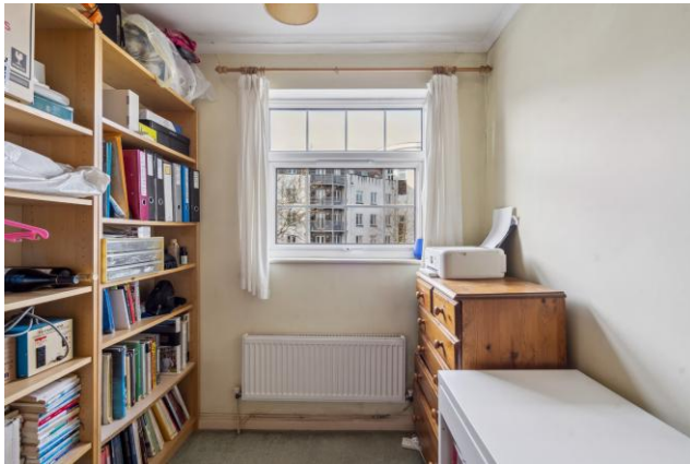
BEDROOM THREE double glazed Georgian grill window to rear, radiator.