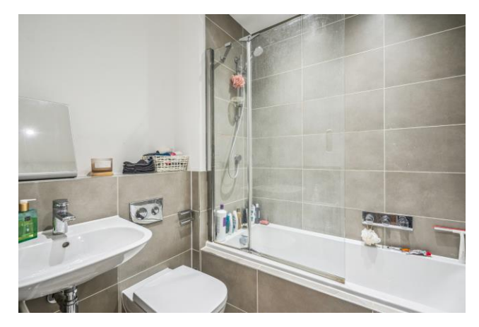
BATHROOM part-tiled walls, tiled flooring, tiled bath with shower screen and shower unit with centre taps suspended wash basin, low WC with concealed cistern, chromium heated towel rail, downlights, extractor fan and tiled flooring.