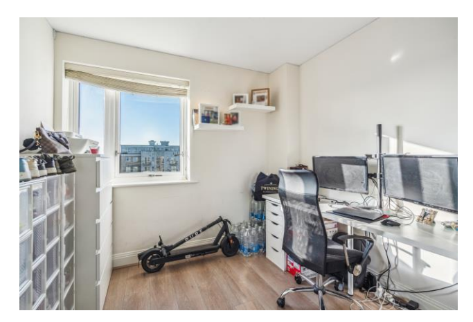
BEDROOM TWO vinyl flooring, double glazed window to front and radiator.