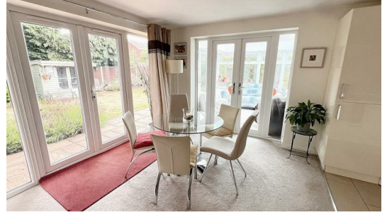
ARDEN DRIVE, WYLDE GREEN, B73 5ND - OFFERS AROUND £500,000